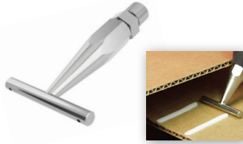
ADJ018 'T' Nozzle Fast centre flap carton sealing